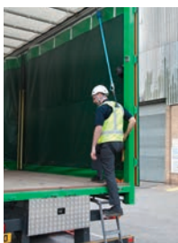
CAPCHA Vehicle Fall Protection Systems