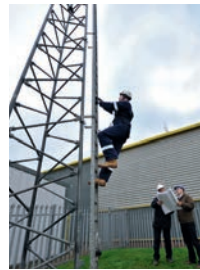
Safety Management Inspections, Servicing and Training