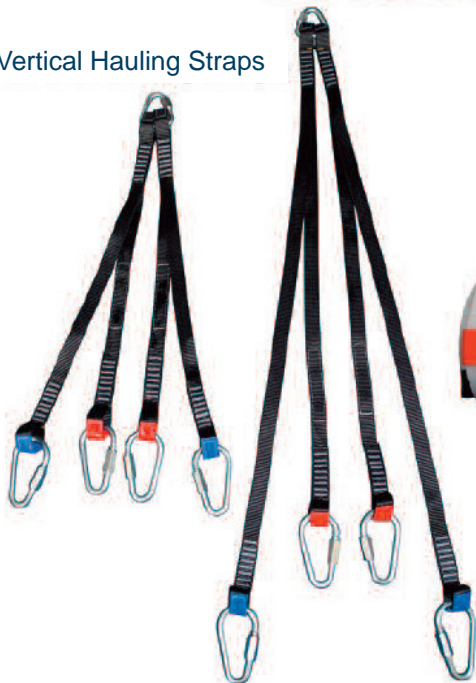
Vertical Hauling Straps