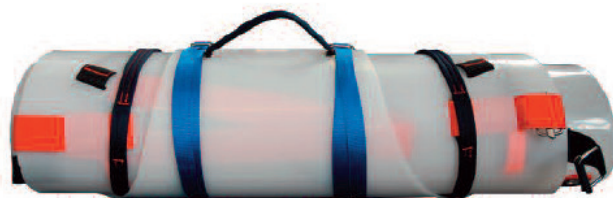
Rolled Stretcher with sewn carry handle