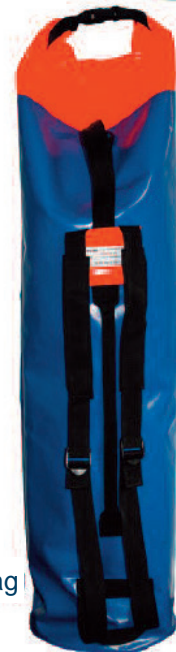
Slx100 Roll Top Bag